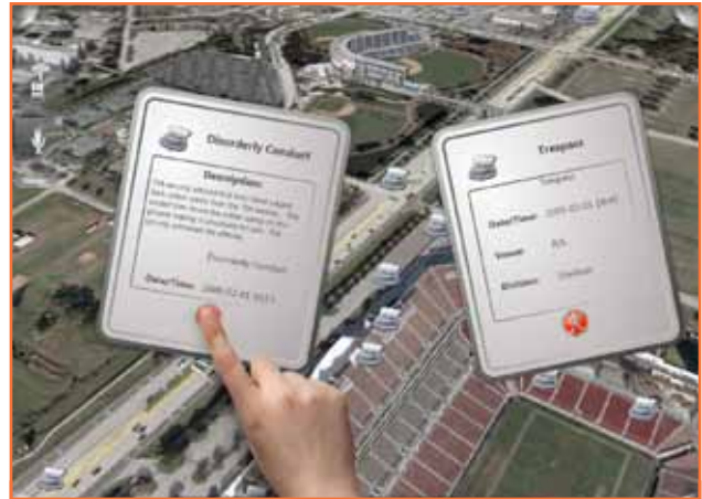
Figure 3: Incident Report Info-Cards

The location of specific units and incidents are easily identified and monitored through Falcon Eye's ability to map real-time geo-spatial data in a three-dimensional display.