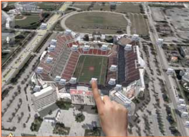
Figure 2: Stadium Incidents Overhead View

The location of specific units and incidents are easily identified and monitored through Falcon Eye's ability to map real-time geo-spatial data in a three-dimensional display.