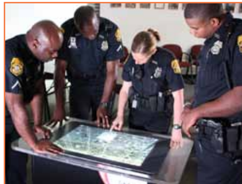
Figure 1: Infusion's Falcon Eye Deployment for the Tampa PD

The first portion of this solution leveraged Falcon Eye to output the collected data into a mapped view. Incidents were displayed in real-time with alert information represented by a series of easily recognized symbols. Falcon Eye also delivered the ability to drill down and view detailed incident reports and overlay statistical data. The information was processed and stored via a Microsoft Office SharePoint Server that also served as the interface between Falcon Eye and partner software.