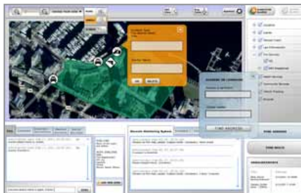
Figure 1: JEPRS Common Operating Picture

JEPRS is a real-time crisis and planned event management solution that employs the newest and most effective GIS technology over a detailed photographic mapping interface.